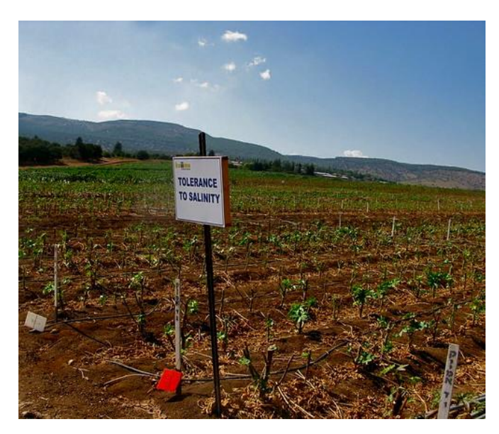
Figure 4. Growing salt-resistant crops.

Examples of manufactured products in the field of agriculture include genetically modified organisms (GMOs) and agrichemicals. GMO produce and livestock are huge aspects of American agriculture. For example, gene editing has been used to create grav-patched cattle to reduce the amount of heat they absorb. Produce such as corn, apples, cotton, and potatoes are genetically engineered. Most crops have their genes edited to resist pests and diseases. However, some crops, like apples and potatoes, are modified to be more visually appealing to consumers. Some GMO potatoes have been developed to prevent the bruising and browning that occur when potatoes are packaged, stored, and transported. GMO apples were made to prevent browning since browning is often mistaken as a sign of an apple spoiling. Furthermore, many processes that other industries use have a connection to agriculture. Cellular processes in wheat, tobacco, and soy have proven to be useful for scientists exploring DNA technology.