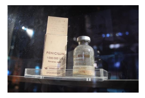
Figure 2. An original bottle of penicillin. "The Discovery of Penicillin" by Solis Invicti is licensed under CC BY 2.0.

Secondary processes include chemicals that cells can create when they are under attack.