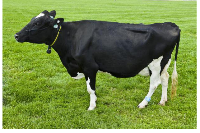
Figure 1. A cow with a GPS and health sensor on its collar.

Have you ever considered a job as a drone pilot? Do you enjoy turning your house into a smart house? Have you thought about trying to protect the data and programs involved with both? Have you ever considered combining that with farming? It might sound funny at first, but farming is quickly becoming very high-tech. Farmers aren't just planting crops or tending to their cows. Now they use drone-mounted thermal cameras to see how healthy crops are, GPS trackers to keep tabs on cows, and phone apps to drive tractors. All of this is being done to make farming more cost-effective and environmentally friendly.