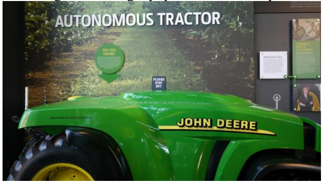
Figure 3. An autonomous tractor produced by John Deere.

fences that corral their cows to turning on their irrigation system, farmers have a wide range of technological farming equipment at their disposal.