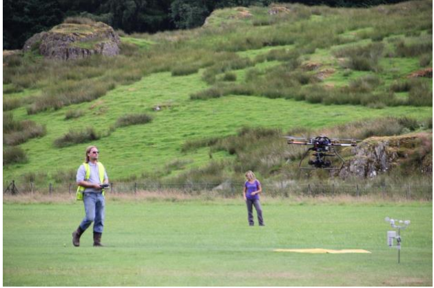
Figure 2. Drone pilots testing their agricultural drone. "<u>Drone test flight</u>" by <u>millstastic</u> is licensed under <u>CC BY 2.0</u>.

pesticide, water, etc. put on a field based on the needs of the particular plant or piece of land. This can be done by hand by changing the equipment. Quickly, though, this started to become more automated. In fact, the first remote-controlled agricultural drone was used in the 1980s to spray rice paddies.